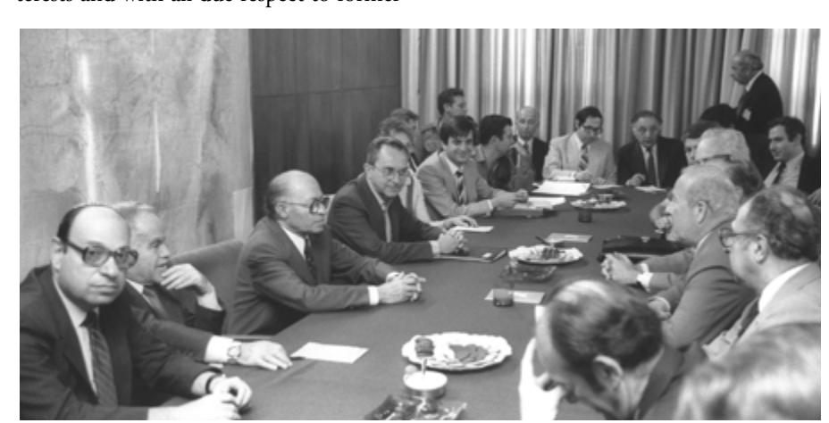
Prime Minister Menachem Begin with Secretary of State George Shultz 1983

Arens reminds us that there have already been leaders who stood up for Israel in the face of American dictates, and under much tougher circumstances. "Begin did it and he told them that we are not a banana republic. Why is it a problem to say this?" he says, and mentions that this stance was taken with the Americans during the period when Israel's economic dependence was far greater than that of today. "The State of Israel has progressed in giant steps since then. Israel of today is a relatively rich state showing impressive growth for years. It is nice to get grants but we must remember that this support also serves American interests. These are not gifts. But even during the economic crisis, when there was no choice and they had to cut their governmental budget, and also the support to Israel, it became clear even then that we can even get by without this. Their support represents perhaps one and a half percent of the Israel gross national product and if this is decreased or eliminated it will not harm us, and certainly not harm us critically. We do not need to change direction because of some dependence or other on a friend like the