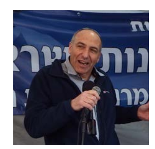
MK Col. (Res.) Moti Yogev at the Mothers' Vigil for Sovereignty 2014.

"Any international promise is worthless. It was so in Lebanon also, as well as in Sinai and in the Golan Heights and the best example is from last year in the Golan Heights where UN forces were overcome and they retreated. No Norwegian mother would send her son to endanger himself on the border between Israel and its neighbors. Such forces are actually no longer relevant in the Middle East. Even American forces would not be loyal to our defense. Until now, they could be depended upon only to