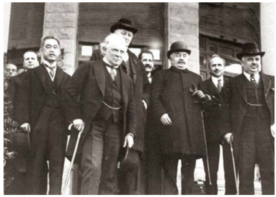
The San Remo Conference April 25th, 1920. With thanks to CILR Canadians for Israel's Legal Rights

international adoption of the Balfour Declaration, which, until then, had only been People as it was determined by the nations, accepted by the British government and from this moment on, became accepted by all of the nations. "This decision was unanimously taken in San Remo by all of the 52 countries that were members of this organization".