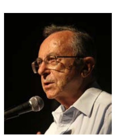
Prof. Moshe Arens

Their support represents perhaps one and a half percent of the Israel gross national product and if this is decreased or eliminated it will not harm us, and certainly not harm us critically. We do not need to change direction because of some dependence or other on a friend like the United States.