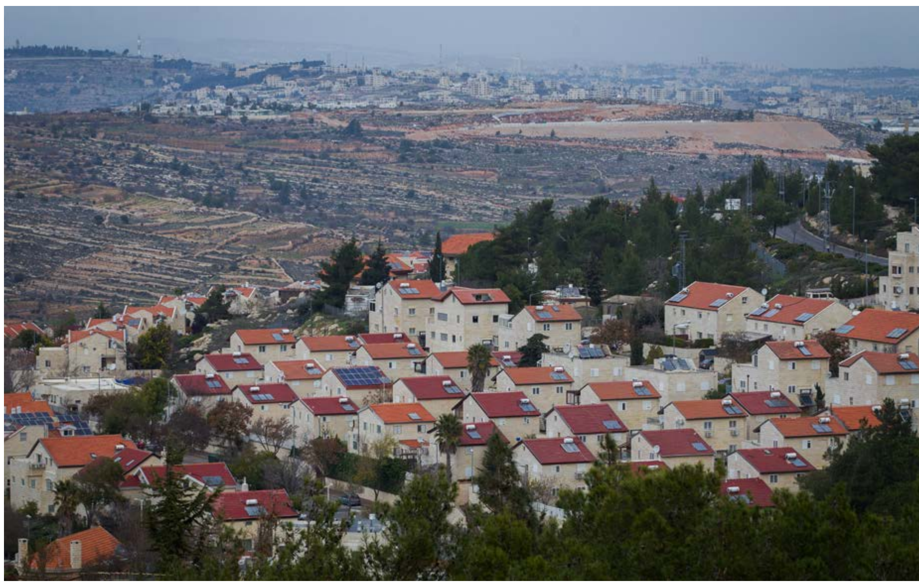
The Palestinians do not want only Judea and Samaria. They see the goal as a Palestine from Metulla to Eilat. The community of Efrat between Jerusalem and Hebron

Political Journal / SOVEREIGNTY / 15 14 / SOVEREIGNTY / Political Journal